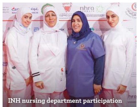
INH nursing department participation