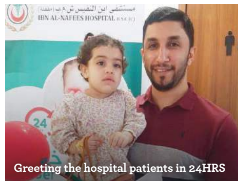
Greeting the hospital patients in 24HRS