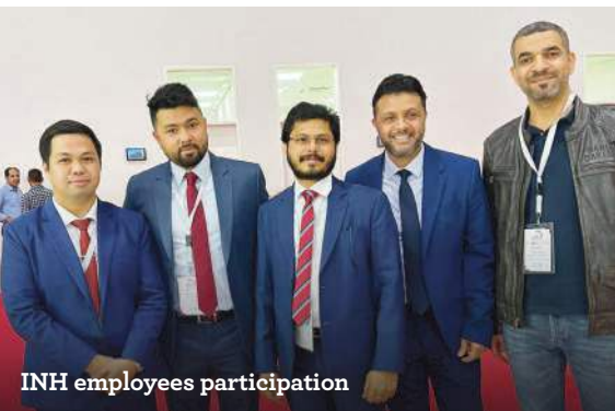
INH employees participation