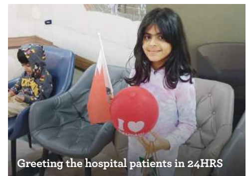
Greeting the hospital patients in 24HRS