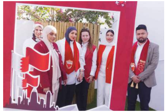
love & compassion