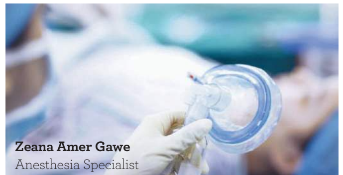
Zeana Amer Gawwe Anesthesia Specialist

Background: Caudal block (CB), dorsal nerve penile block (DPNB), and systemic opioids are common techniques used in pediatric surgeries to provide analgesia for penile surgery such as circumcision. This study aimed to compare the effectiveness of the CB with other methods of postoperative pain release.