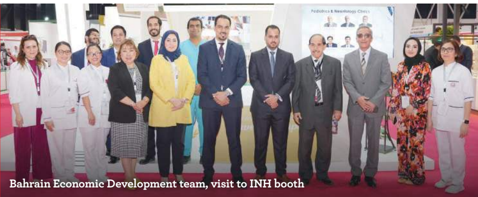
Bahrain Economic Development team, visit to INH booth