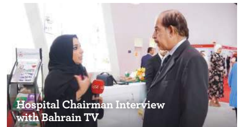
Hospital Chairman Interview with Bahrain TV