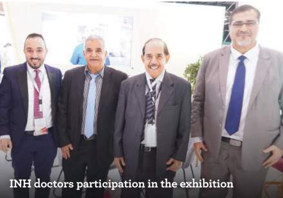
INH doctors participation in the exhibition