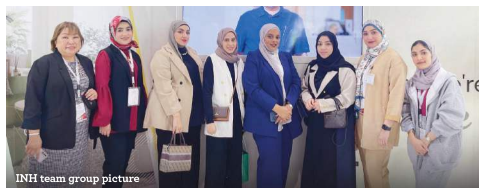
INH team group picture