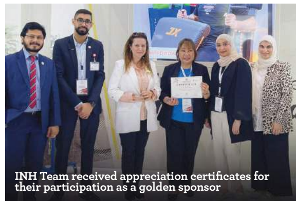
INH Team received appreciation certificates for their participation as a golden sponsor