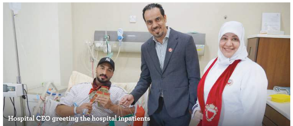
Hospital CEO greeting the hospital inpatients