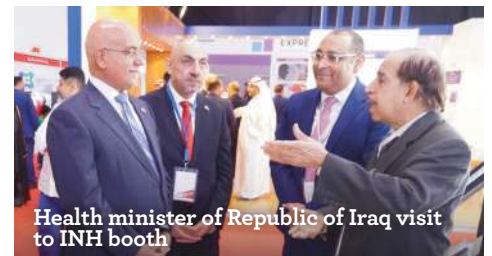
Health minister of Republic of Iraq visit to INH booth