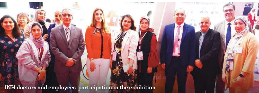
INH doctors and employees participation in the exhibition