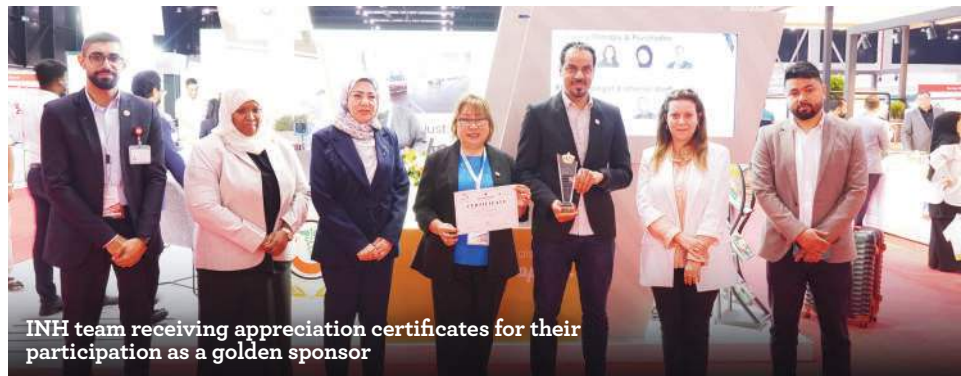
INH team receiving appreciation certificates for their participation as a golden sponsor