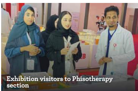
Exhibition visitors to Physiotherapy section